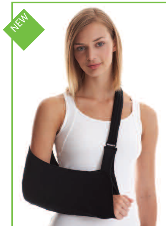
Ultimate Arm Sling