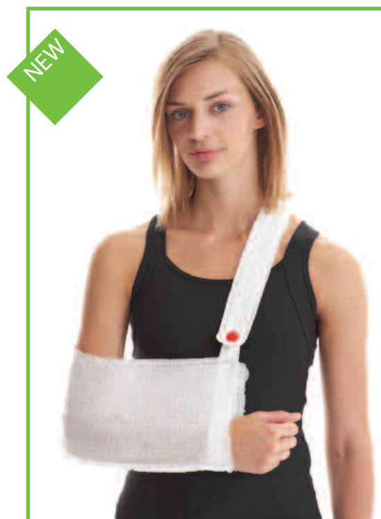
Adult ER Sling