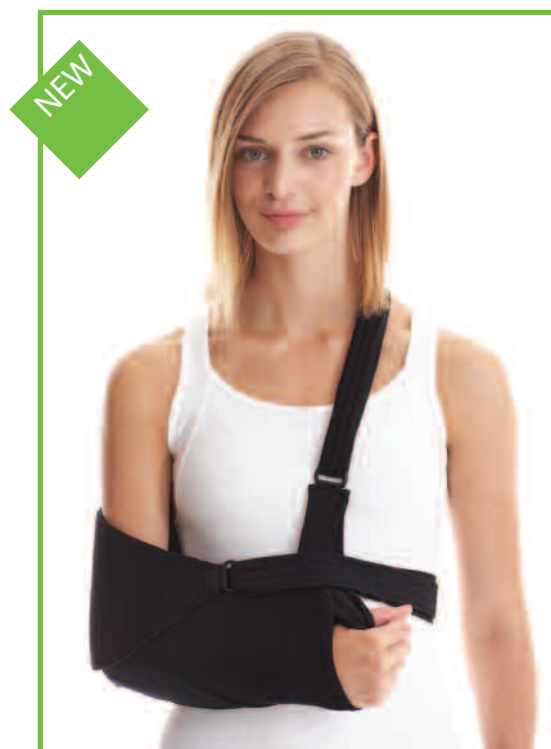
Ultimate Arm Sling with Joslin Swathe (Arm sling not included)