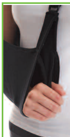
Hand and thumb loop.