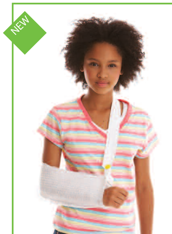
Paediatric ER Sling